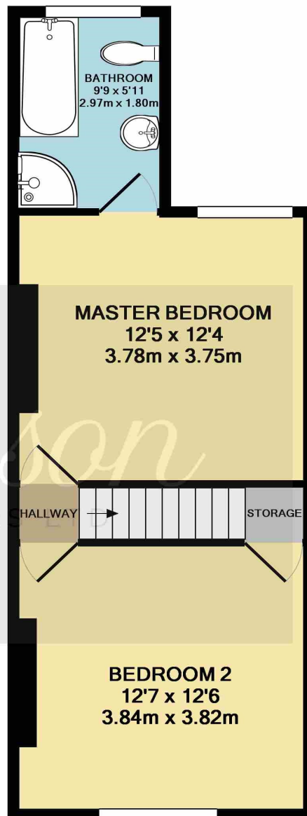
1ST FLOOR APPROX. FLOOR AREA 368 SQ.FT. (34.2 SQ.M.)

TOTAL APPROX. FLOOR AREA 783 SQ.FT. (72.7 SQ.M.)